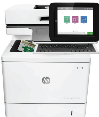
HP Color LaserJet Managed Flow MFP E57540c