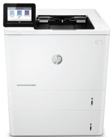
HP LaserJet Managed E60065x