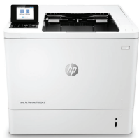
HP LaserJet Managed E60065dn

This HP LaserJet Printer with JetIntelligence combines exceptional performance and energy efficiency with professional-quality documents right when you need them—all while protecting your network from attacks with the industry's deepest security. 1